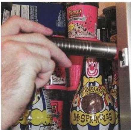
A close-up look at the wand that reports and records floor conditions.